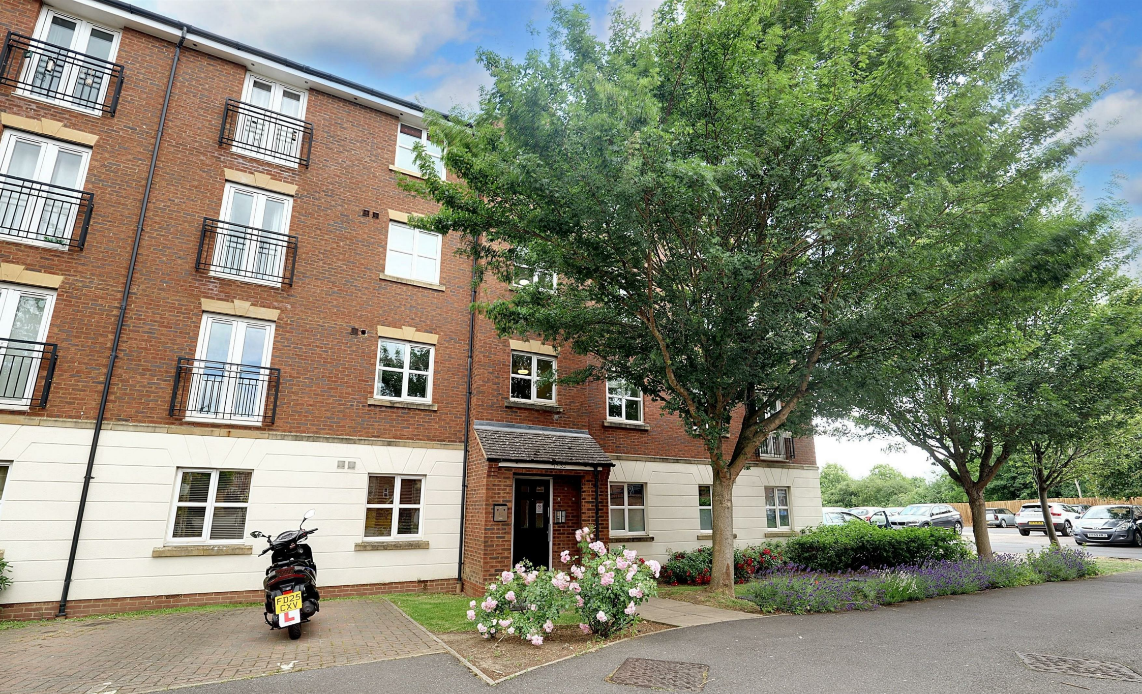
Fount Court, Market Harborough, LE16 9GF